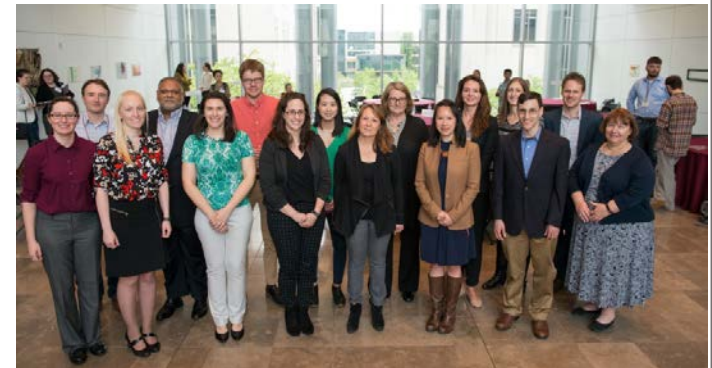
myCHOICE Alumni Forum 2017 17 alumni on panels and 1-on-1 mentor sessions

T32 professional development requirement Tracking trainees