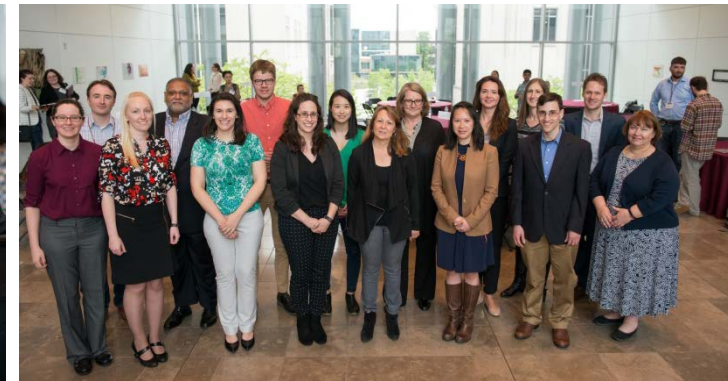
myCHOICE Biological Sciences Alumni Forum 2017 17 alumni on panels and 1-on-1 mentor sessions